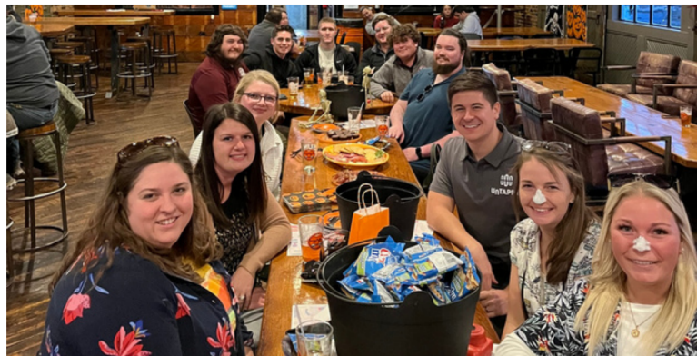
YOUNG PROFESSIONALS NETWORK

WOMEN'S BUSINESS COUNCIL: More than 60 women participate in the WBC. Together, they hosted a successful Leadership Conference and Holiday Luncheon in 2022, with over 300 in attendance for both.