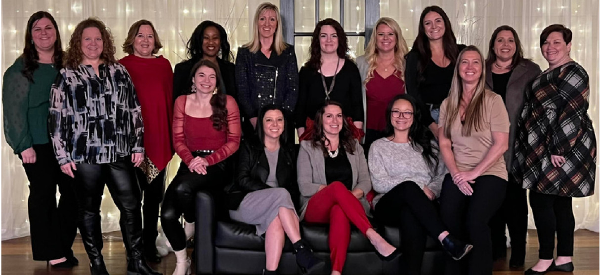
WOMEN'S BUSINESS COUNCIL MEMBERS AT THEIR HOLIDAY LUNCHEON

AMBASSADORS: The committee is rapidly growing and very engaged. With 30 active ambassadors in 2022, the group was able to create a vision statement, "Making our community stronger one connection at a time." The group holds its meetings at various locations to build new connections and help support local businesses and organizations.