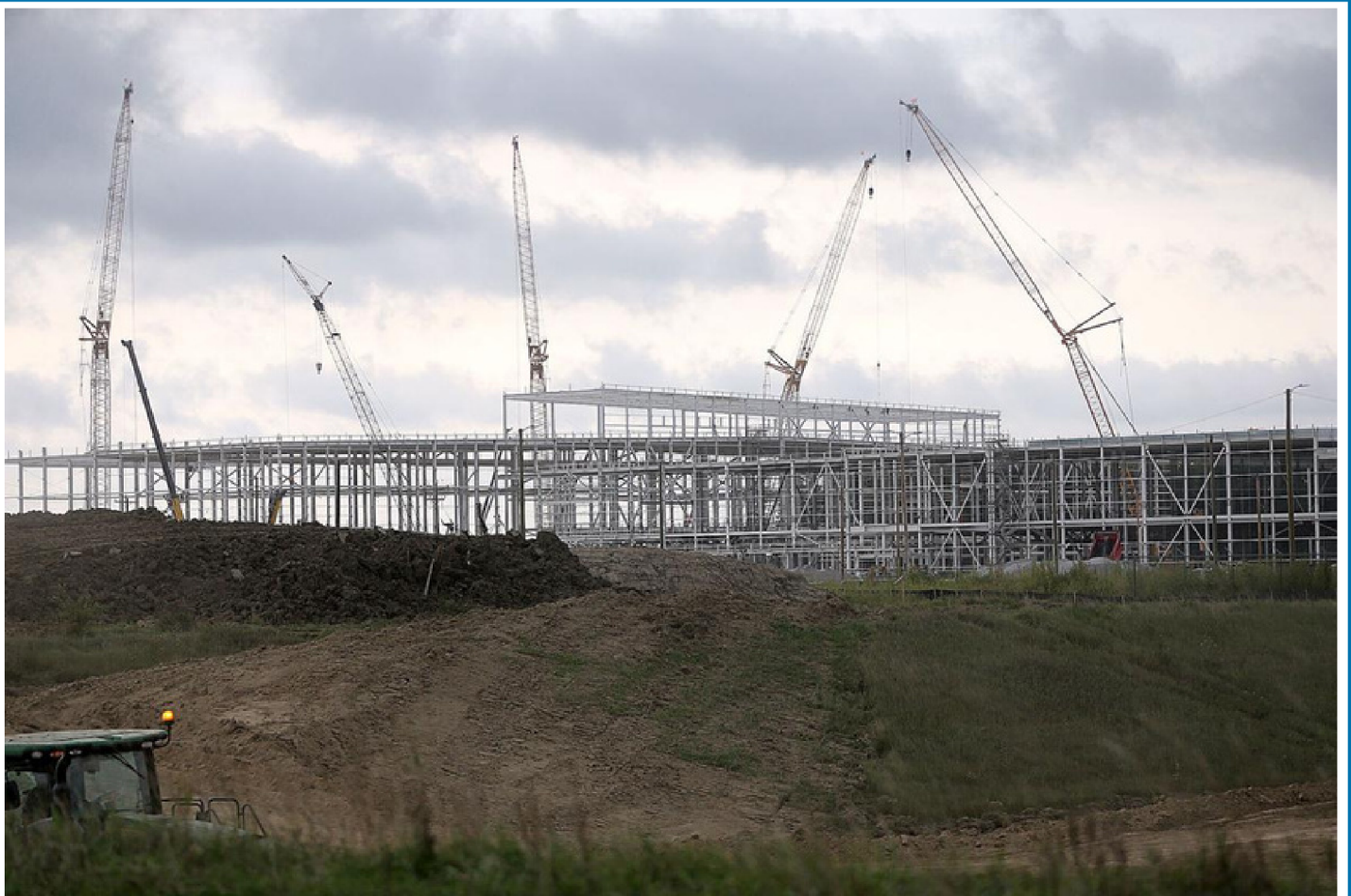
THE SITE OF EV BATTERY PLANT BEING BUILT IN KOKOMO

Having land already secured put the community in a solid position to compete for the Stellantis/Samsung SDI development as a portion of the required property was immediately available.