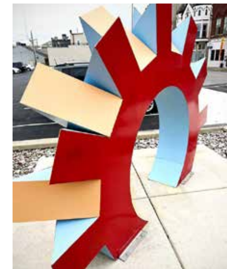
Projects funded in part by grants include new brand signage (top), student sculpture (middle) and the 2023-25 Kokomo Sculpture Walk (bottom).