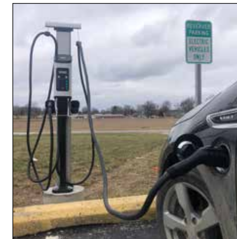
EV charging station at Inventrek.

3: In anticipation of the opportunities to come with the EV battery plants, Inventrek helped develop and host Korean