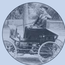
Automotive pioneer and Kokomo native Elwood Haynes was one of the visionaries who founded the Chamber of Commerce in 1914.

The anniversary was also honored at the Alliance's annual dinner in November, where historical artifacts were displayed, offering a glimpse into the Chamber's rich legacy and its lasting impact on our region.