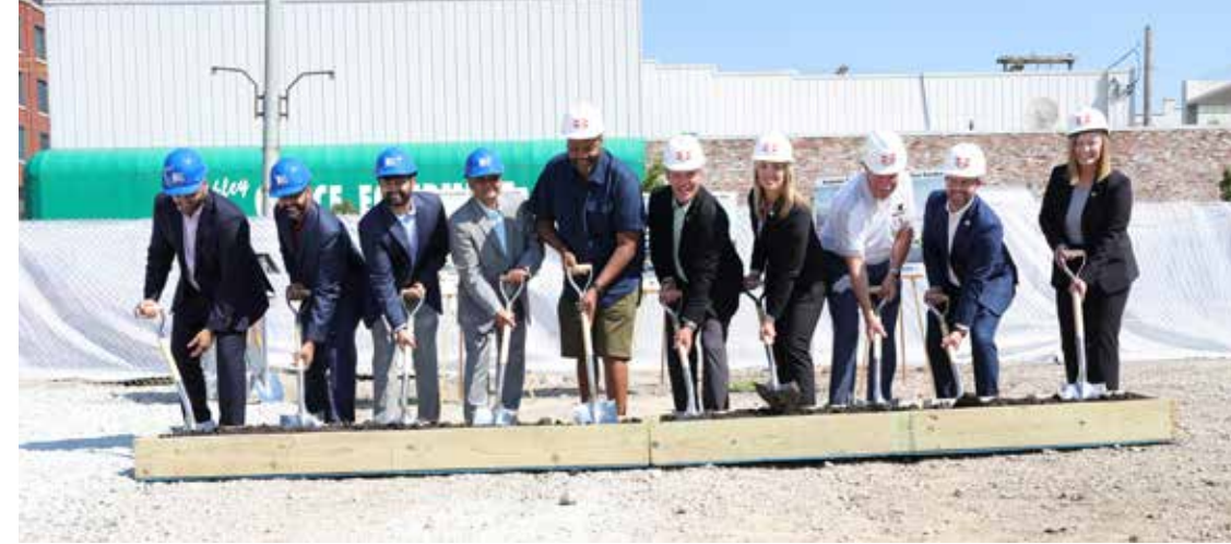
The Alliance broke ground alongside several community leaders at the project site, which is located between Main and Union streets, bordered by Superior Street and Wildcat Creek.

Branded as a Hilton Garden Inn, the hotel is expected to have 108 guestrooms that will feature a range of amenities including an indoor pool, fitness center, and ergonomic workspaces, as well as a restaurant and lounge that will cater to both visiting and local guests.